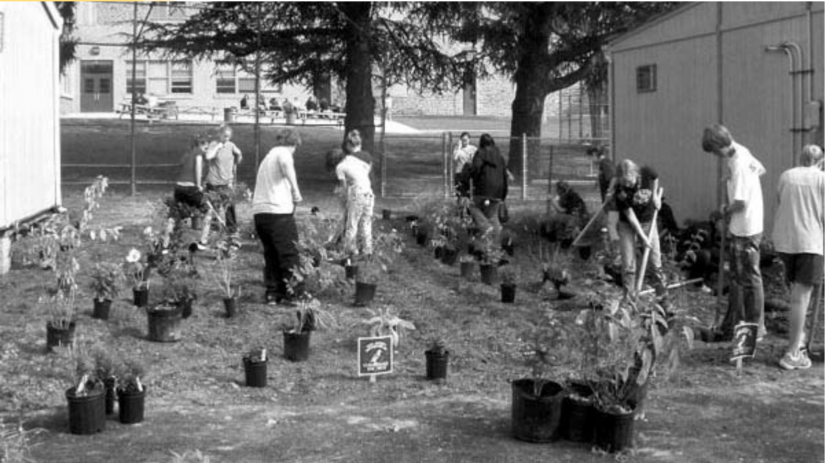
Erosion control problems prompted students in Baltimore County to create a rain garden on their school grounds.